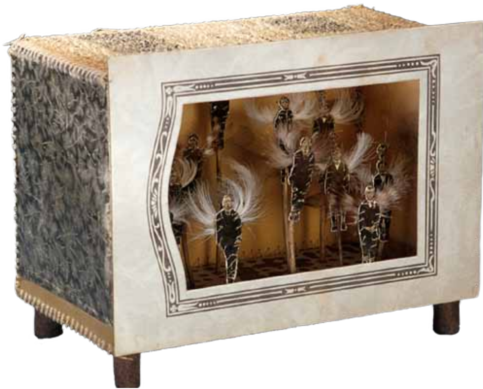
Lisa Kokin, La Caridad , mixed media box, 6.5 x 3.5 x 5 inches, 2002